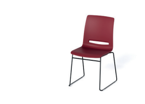
V-Care frame chair CFS H: 860mm W: 510mm D: 572mm