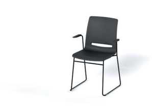
V-Care frame chair CFSA H: 860mm W: 593mm D: 572mm