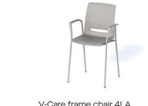
V-Care frame chair 4LA H: 960mm W: 627mm D: 579mm