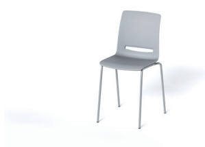
V-Care frame chair 4L H: 960mm W: 522mm D: 589mm