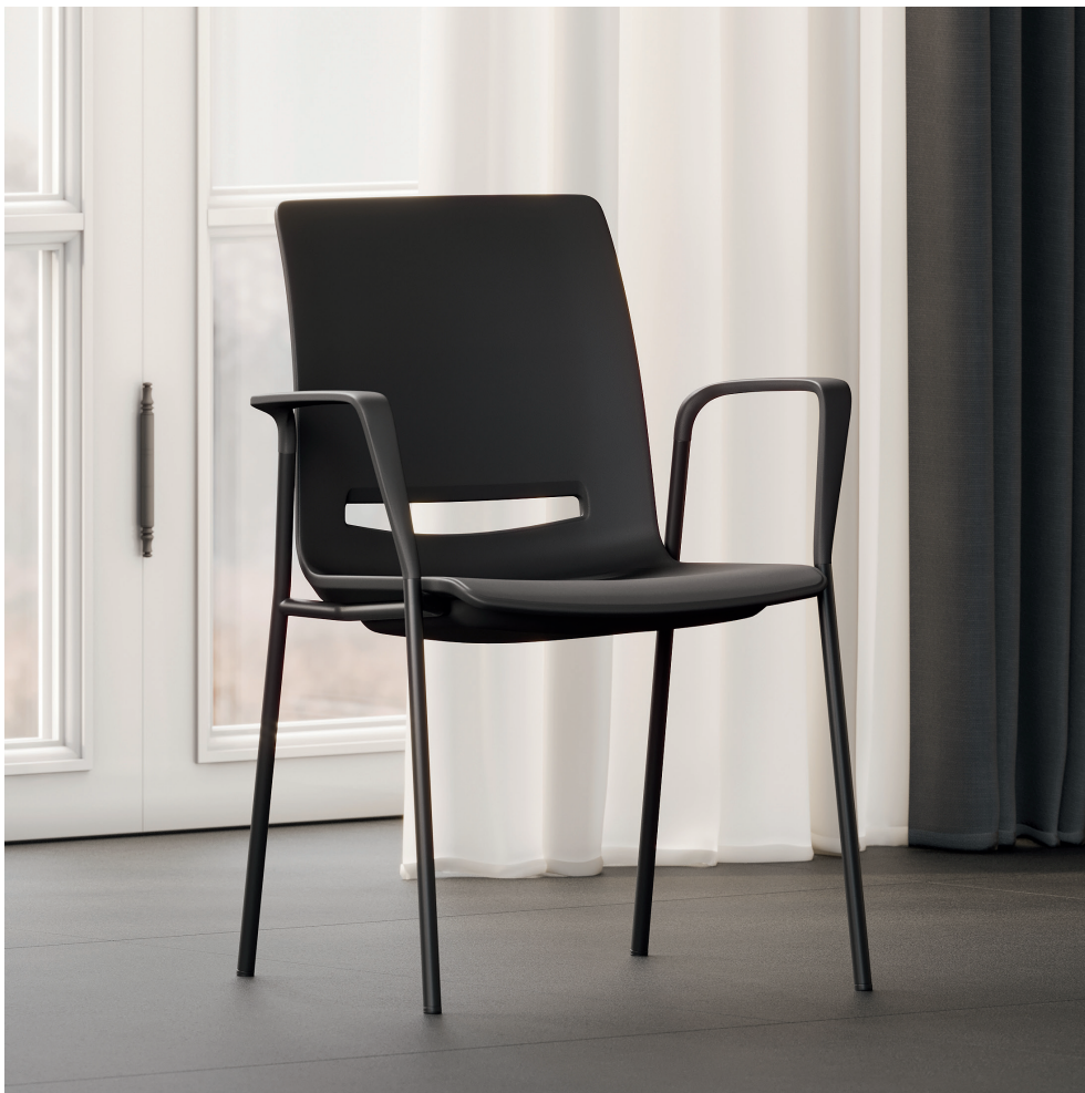
The reinforced armrests